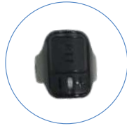
Wireless PTT POA121