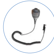
Water-proof Remote Speaker Microphone SM26N1-P