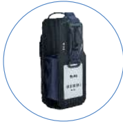
Nylon Carry Case NCN029