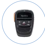
Wireless Remote Speaker Microphone SM27W2