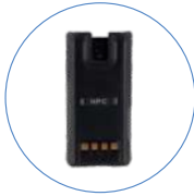
2,400 mAh Li-Poly Battery BP2402