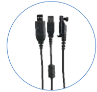
Programming Cable PC156