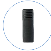
Belt Clip BC39