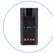
4,000 mAh Li-poly Battery BP4005