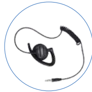
Receive-only Swivel Earset EH-02