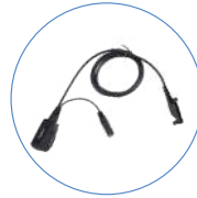
PTT&MIC Controller ACN-02P