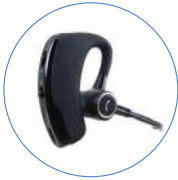
BT Earpiece EHW08