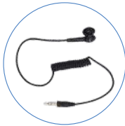
Receive-only Earbud ES-01