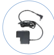
Power Adapter (2A)