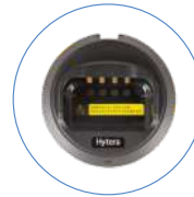
Charger (1A) CH10L29