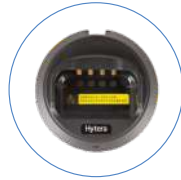
Charger (2A) CH20L13